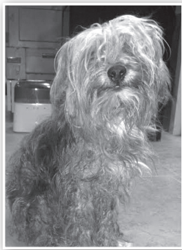
Sir Valiant when he arrived at the shelter.

One recent miracle was Sir Valiant's amazing transformation. This little Yorkie came to Animal Allies after being found trapped in a crate on the side of a rural road near Duluth. His matted coat was filthy, his body just skin and bones underneath. On the day Sir Valiant arrived, shelter staff gave him a bath and shaved off his matted fur. He was given vaccinations, a microchip, and a health check. When he was ready for adoption a few days later, he left the shelter in the arms of his new family.