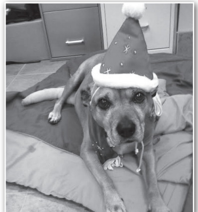
Popo after her first ACL Repair surgery, celebrating the holidays with staff.