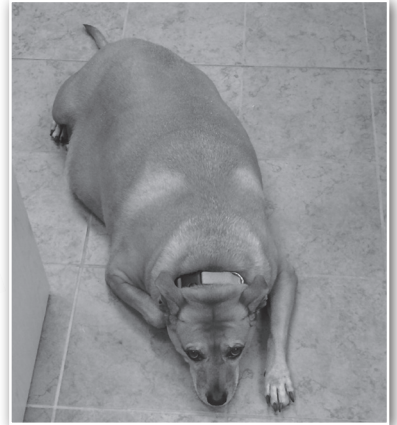
Popo when she arrived at the shelter.

Keiko is one of several diabetic cats who entered into the shelter's care in 2015. It can take 1-2 months to regulate this disease, including the initial diagnosis, starting insulin, checking glucose levels weekly, and altering diet. After Keiko's diabetes was regulated, she patiently waited at the shelter for over a month before she was adopted. She is now with her new family who loves her very much.