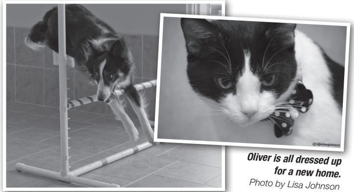
Huck shows off his moves at the agility demonstration by Ram Reizel Dog Training.