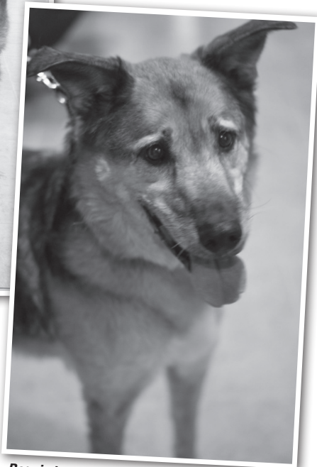
Reggie is happy and comfortable as he heads to his new home.