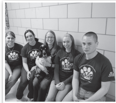
BARC Program Participants

BARC students have also participated in Animal Allies’ community events and have developed a training program for Dog Buddies who would like to expand their knowledge of basic kennel manners and learn how to incorporate “polite puppy” training into their visits.