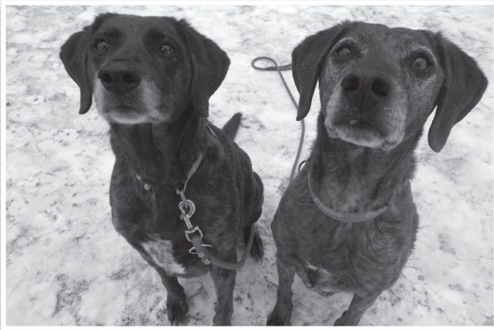
Daisy and Duke, lifelong friends, were adopted together at the event.

We appreciate all who participated in this unique and exciting event!