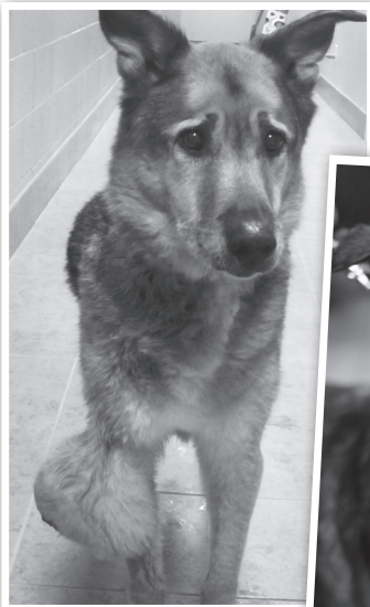
Reggie, on the day he came into the shelter.