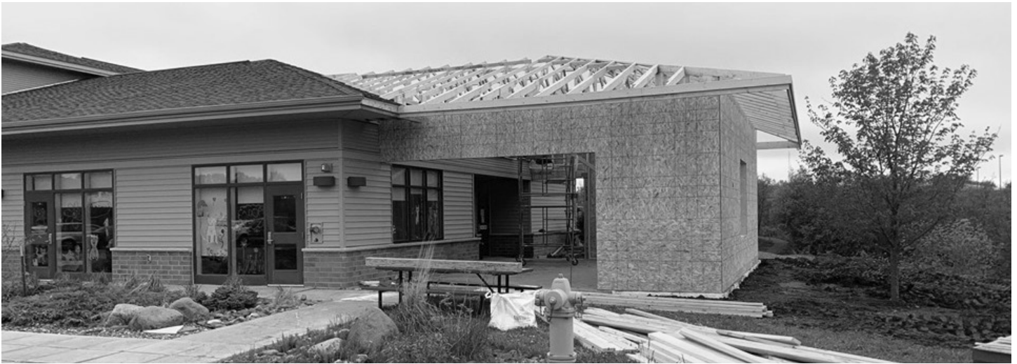
A work in progress in early June.

Humane Education expansion plan: A brand-new Activity Center