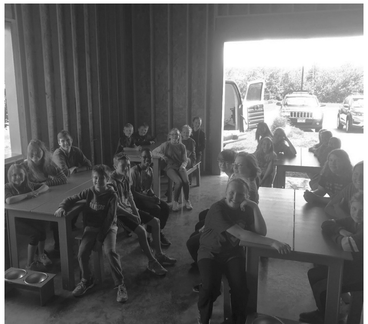
Summer campers gathered in the Activity Center.

When the snow finally melted and the ground finally thawed this spring, excavation began and concrete was laid. Before we knew it, the whole structure was up. Now, the Activity Center is housing summer camps, birthday parties, puppy classes, microchip clinics, and more. We are so glad to have this opportunity to reach more people and help more pets! Thank you to everyone who contributed and continues to support our work.