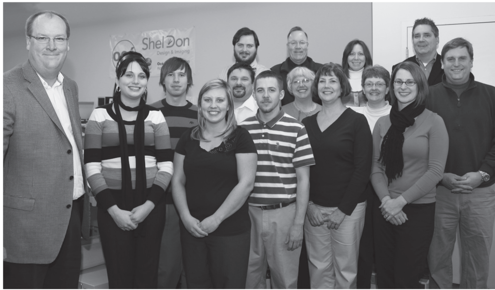
ShelDon Team ready to design and print the next issue of the Paw Print - Thank you ShelDon for all you do for animals!

Next time you are in downtown Duluth, please stop by the ShelDon location on Superior Street across from the Fond du Luth Casino and thank them for their services to the animals and people of our community.