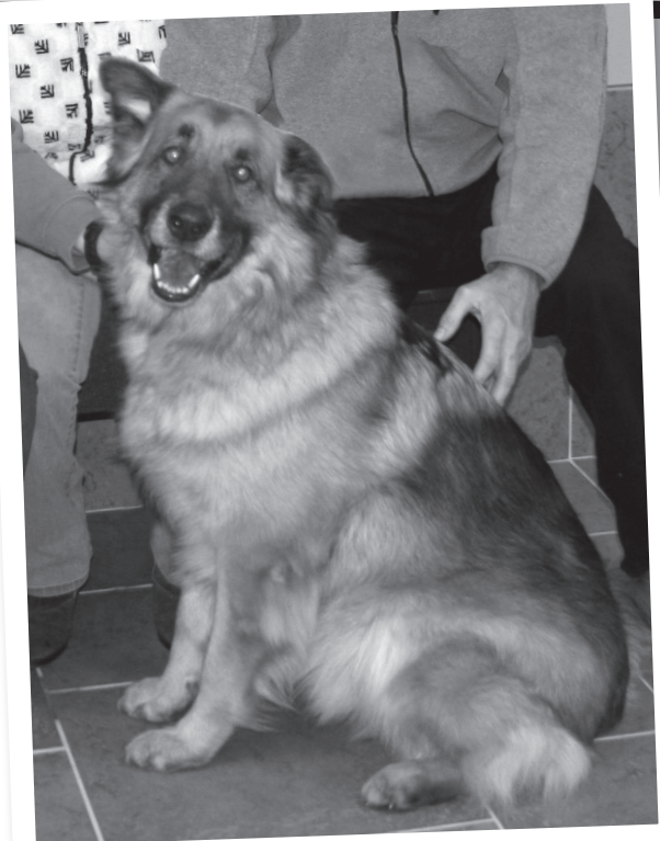
Kitty Kat, happy, healthy and loving his new life.

Thank you for your support. YOU make the difference in the lives of our furry companions. Thank you!